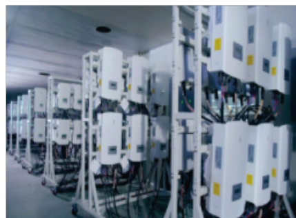
Duration Testing Heat Chamber

Solis inverters have an industry leading low failure rate of 0.5% measured over the more than one million sold and installed worldwide.